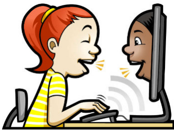
A Parent's Guide to Social Media