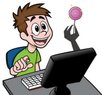
A Parent's Guide to Online Grooming