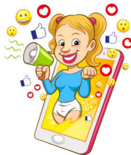
A Parent's Guide to Online Influencers