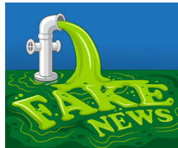
A Parent's Guide to Fake News