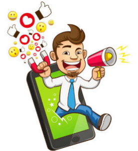
A Parent's Guide to Live Streaming