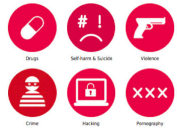
A Parent's Guide to Privacy Settings

Online safety is when young people know who they can tell if they feel upset by something that has happened online.