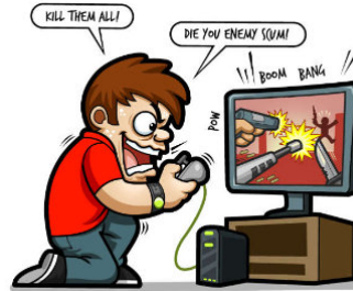
A Parent's Guide to Gaming