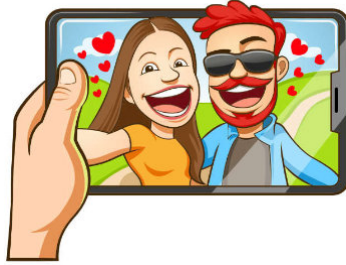
A Parent's Guide to Sharing Pictures