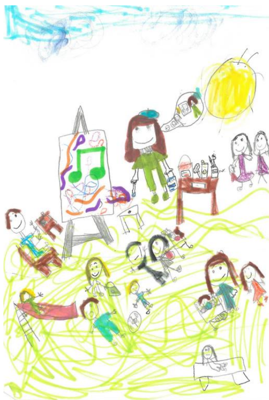
A Drawing Brooke (Y4)

Enjoy your last few weeks in your current class, and get ready to meet your new teachers!