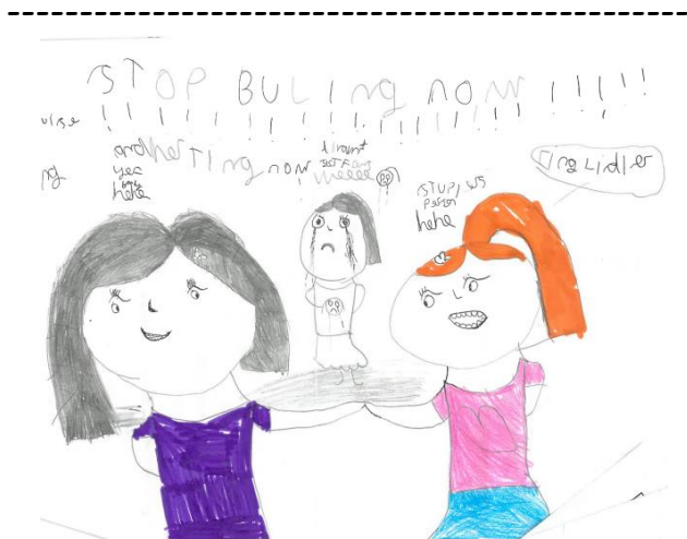
A Drawing by Tia (Y4)

We are looking for beautiful pieces of art work to put into our newsletter. Post your artwork into letterboxes or give it to your teacher.