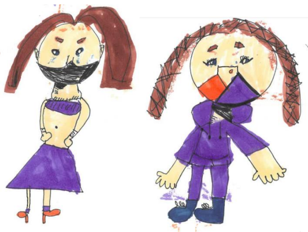
Drawings by Enya (Y3)

We are looking for beautiful pieces of art work to put into our newsletter. Post your artwork into letterboxes or give it to your teacher.